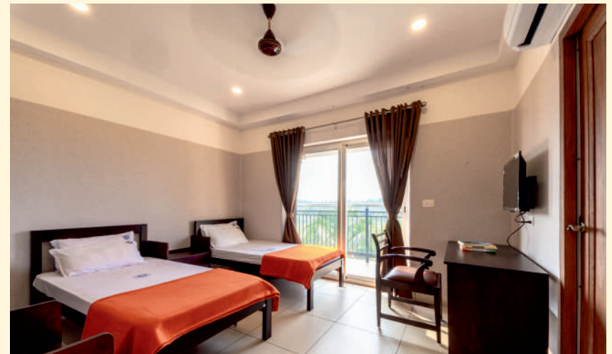
Premium Suite Bedroom