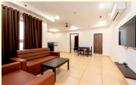
Standard Suite Living Area