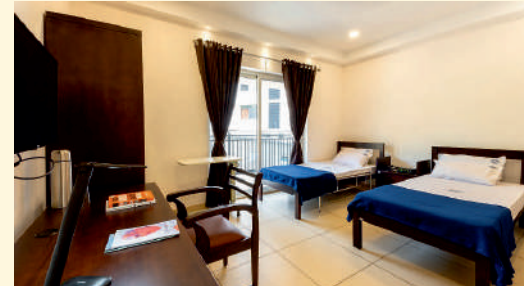
Standard suite Bedroom

Kavathikalam, Kottakkal - 676 503, Malappuram Dist., Kerala Ph: +91 483 3502000 Email:ahrckkleast@aryavaidyasala.com