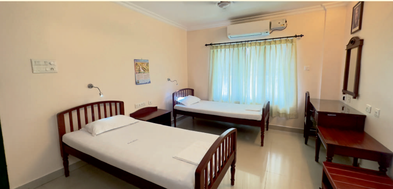
Suite Type 1 Bedroom