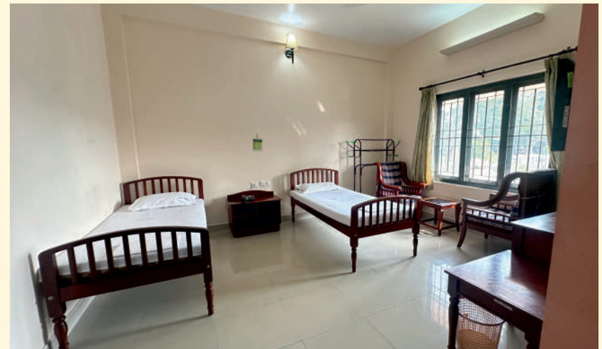
Double Room AC