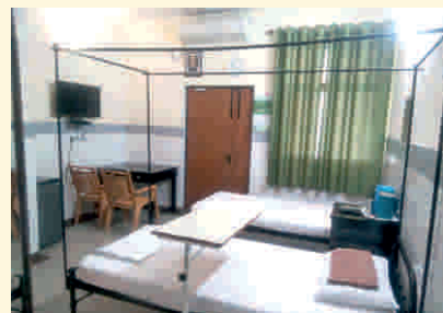
Deluxe - Room Type - C