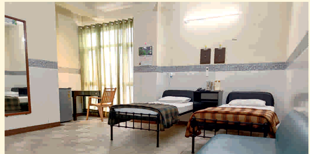
Deluxe Room Type - A