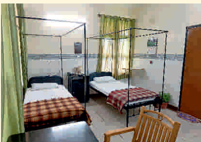
Deluxe Room Type - B