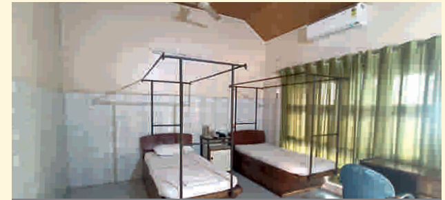
Private Room- AC & Non AC

Plot No. 18-X, 19-X, Institutional Area, Karkardooma, Delhi - 110 092, India Mobile : +91 09971130460 Tel: +91 011 - 22106500, 22106515, 22106516, 22106517 Email: ahrcdelhi@aryavaidyasala.com