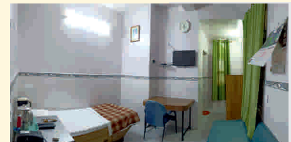
Small Semi Pvt Room- AC & Non AC