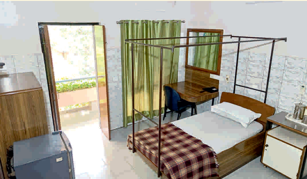
Deluxe Room Old Block - AC & Non AC