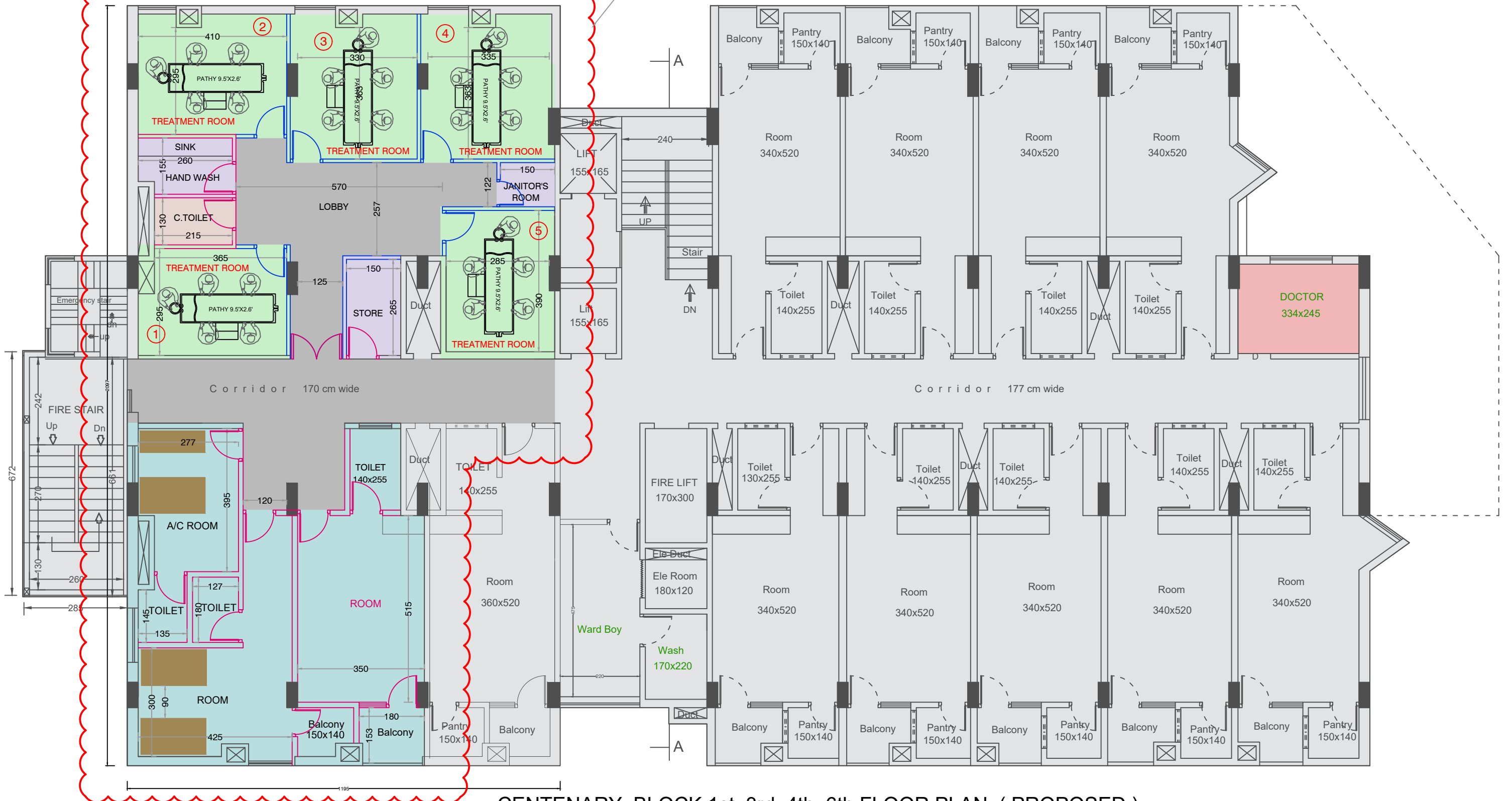
CENTENARY BLOCK 1st, 3rd, 4th, 6th FLOOR PLAN ( PROPOSED )